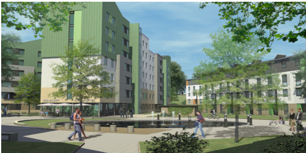
An artist's impression of The Green

The University plans to open a new development called The Green which will add 1,014 bed spaces on campus.